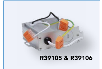
R39105 & R39106