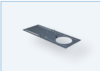
R39108 RENO-MP4 4" Mounting Plate without clip