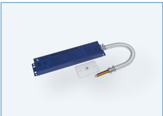
R83000 RENO-EM-H08 Emergency LED Driver (100-347V AC, 50-60Hz, 12W)