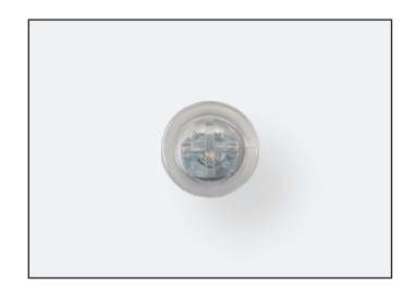
RENO-WP-PS Standalone Photocell Sensor (DC)