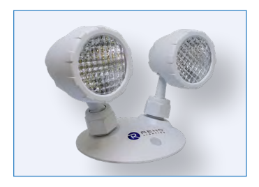
R61103 RENO-ERH2W-2 Double Head Emergency Light