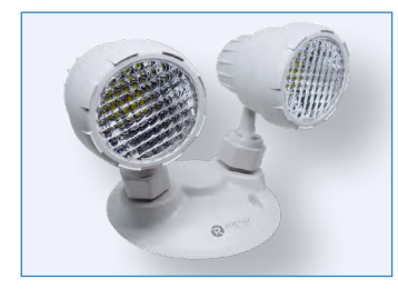
R61105 RENO-ERH5W-2 Double Head Emergency Light