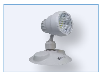
R61106 RENO-ERH5W-1 Single Head Emergency Light