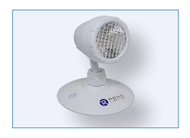
R61101 RENO-ERH2W-1 Single Head Emergency Light